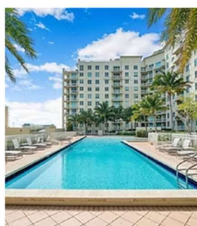
50,000 SQ FT POOL DECK