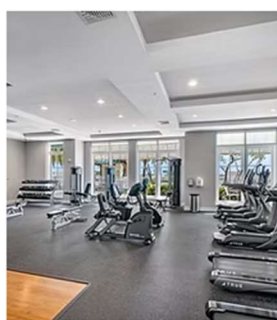
FITNESS, SAUNA, STEAM ROOM