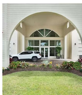
ASSIGNED PARKING WITH VALET